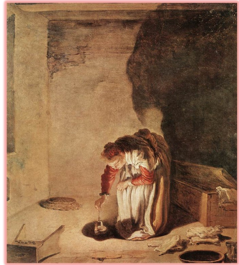
Parable of the Lost Drachma Domenico Fetti (1589–)

“Here I am to worship, here I am to bow down, Here I am to say that You're my God Altogether lovely, altogether worthy, Altogether wonderful to me.” Here I am to worship Here I am Here