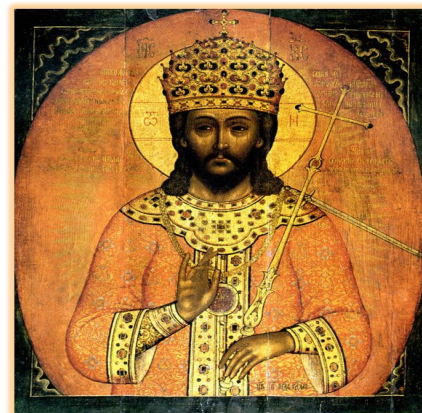
Christ as King of Kings, a Russian icon from Murom, 1690

Worship begins as the people gather--greeting one another, praying in silence, sharing announcements, or offering music to the glory of God. The act of assembling in Jesus' name bears witness to the Church's identity and mission as Christ's body in the world.