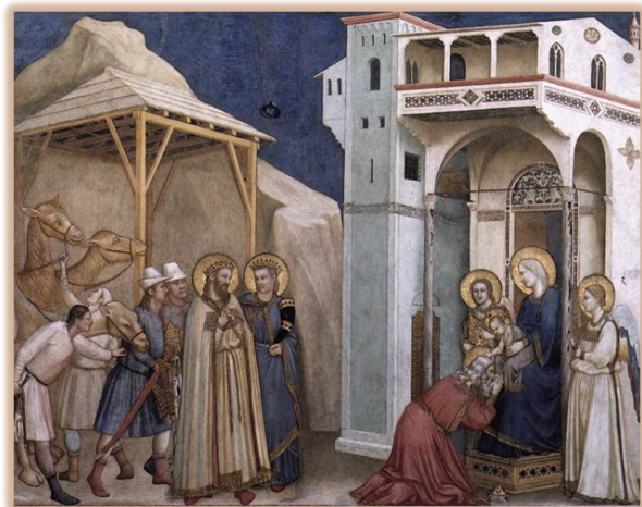
The Adoration of the Magi, Fresco at the Lower Church of the Basilica of San Francesco d'Assisi in Assisi, Italy

Thy word is a lamp unto my feet, and a light unto my path.