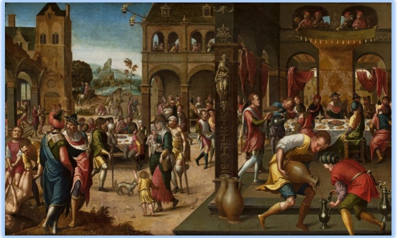
Parable of the Great Banquet by Brunswick Monogrammist (circa 1525), location: National Museum, Warsaw

Grace to you and peace from God our Father and the Lord Jesus Christ!