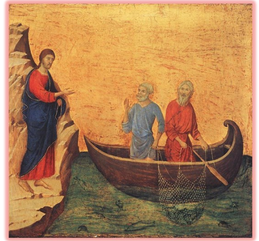
Calling of Peter and Andrew - Duccio di Buoninsegna (1255–1319)