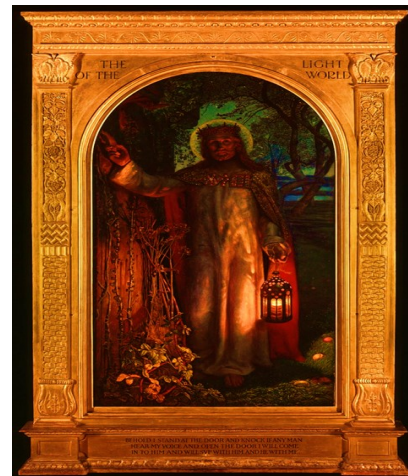
The Light of the World , by Holman Hunt 1851, in St Paul's Cathedral