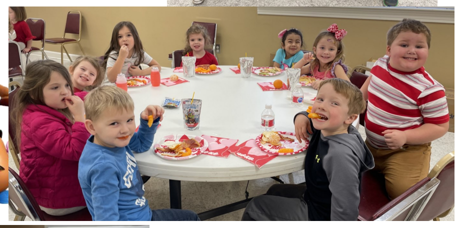
valentine's Day Party