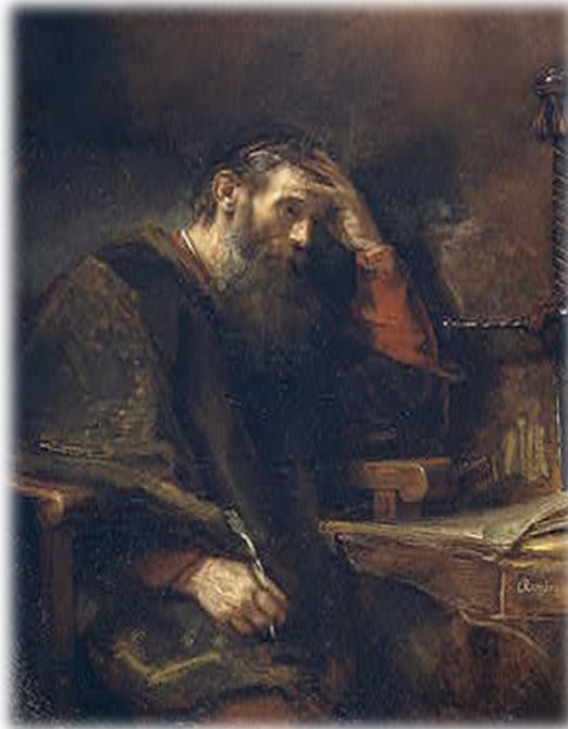
“The Apostle Paul”