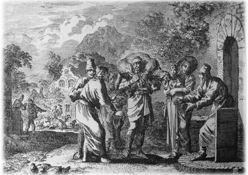
"The Parable of the Lost Sheep" etching by Jan Luyken (April 16, 1649 - April 5, 1712)

Grace and peace to you from God our Father and our Lord Jesus Christ!