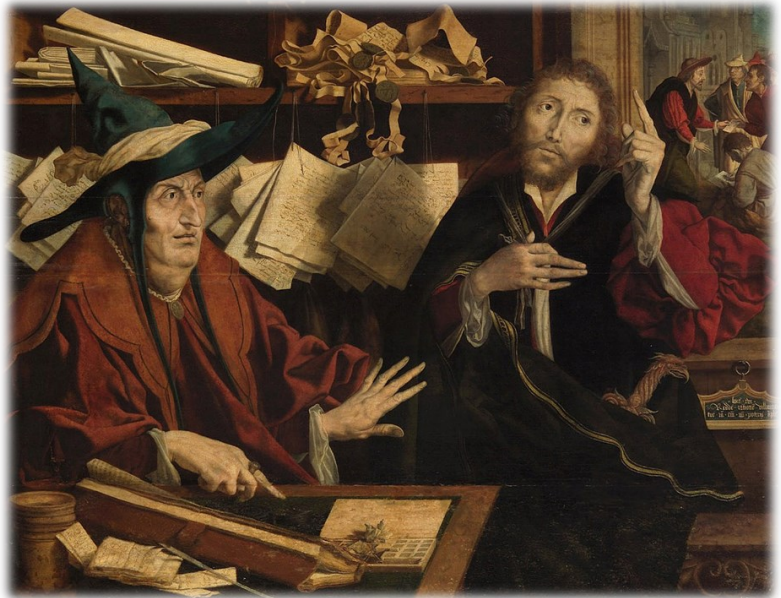
"Parable of the unjust steward" c. 1540 by Marinus van Reymerswaele (1490-1546)

Grace and peace to you from God our Father and our Lord Jesus Christ!